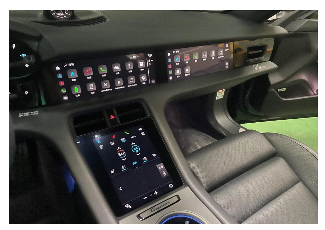
Stylish technological interior setting of the Porsche car