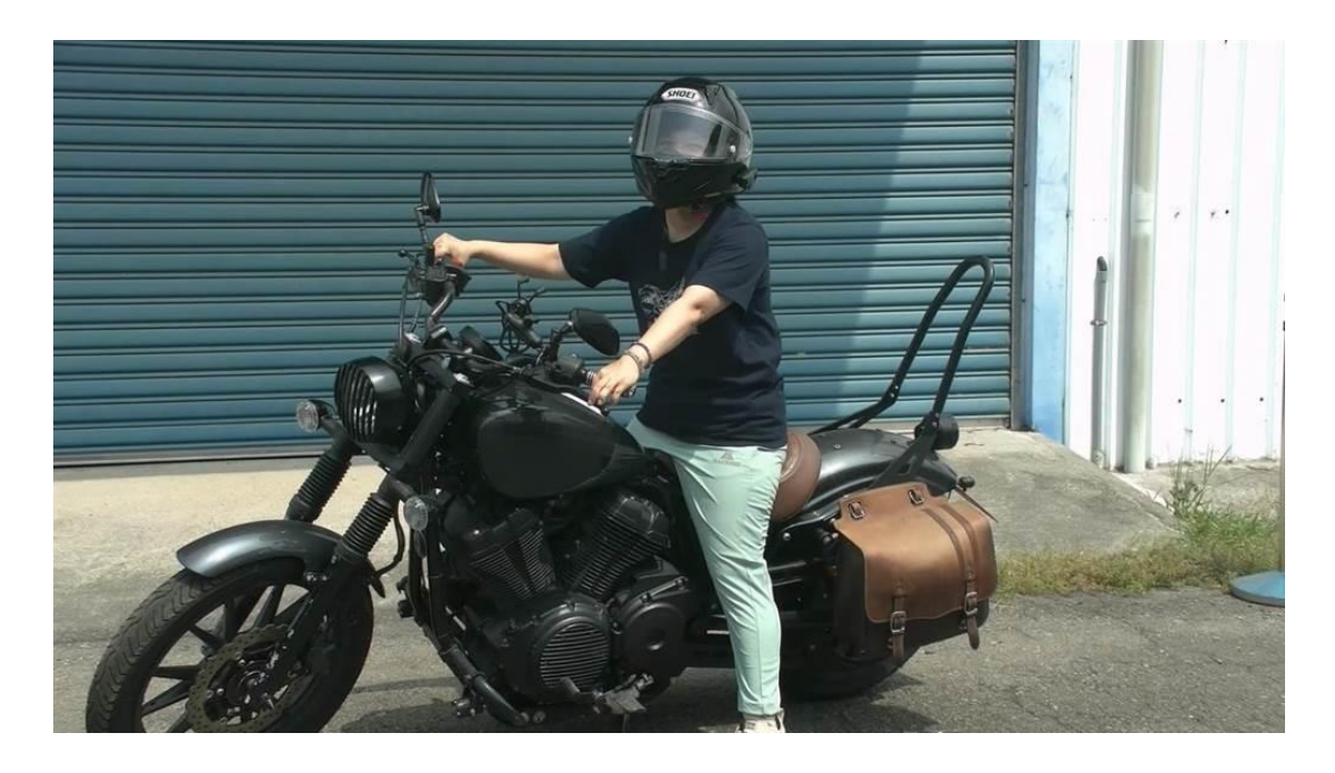
The Changhua Branch auctioned the American-style Yamaha XV950