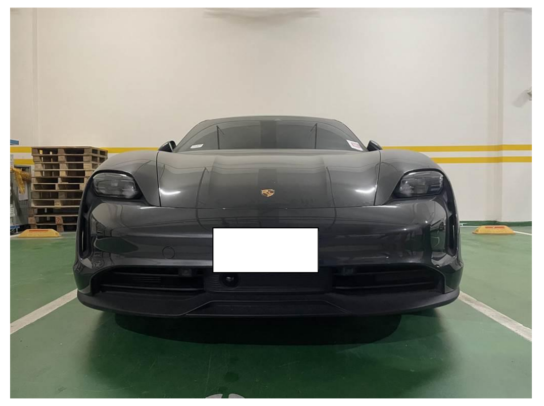
TAYCAN 4S fully electric four-door Porsche sports car