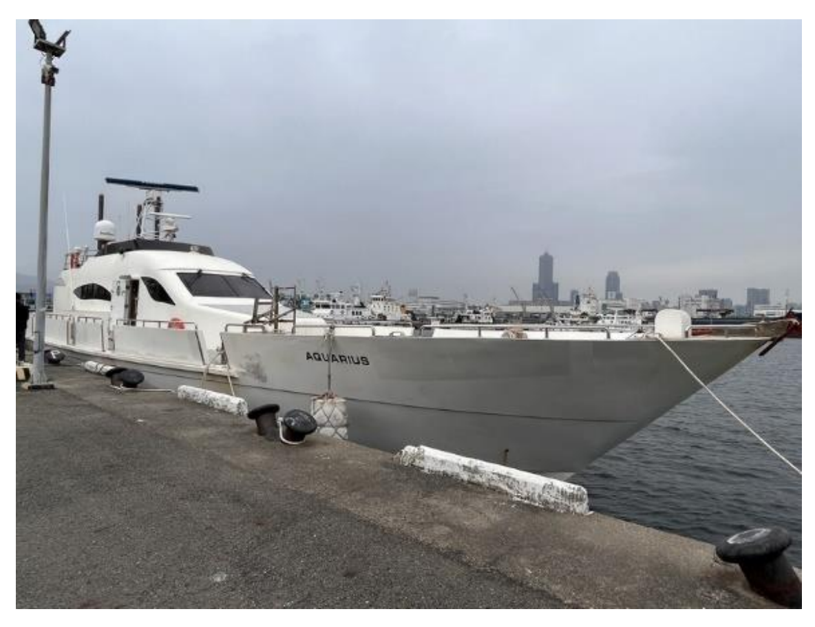
The luxury yacht auctioned by the Kaohsiung Branch under the entrustment of Kaohsiung District Prosecutors Office, reached a bid price of NT$29.09 million