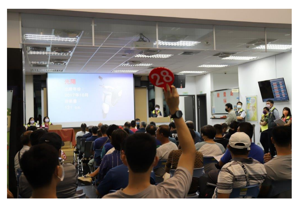
On-site photo of the auction at the Kaoshiung Branch