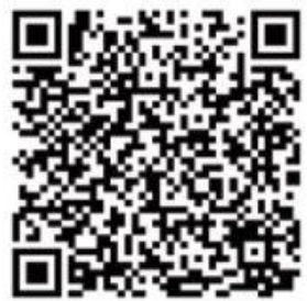
The special issue of AEA World was released on December 20, 2023