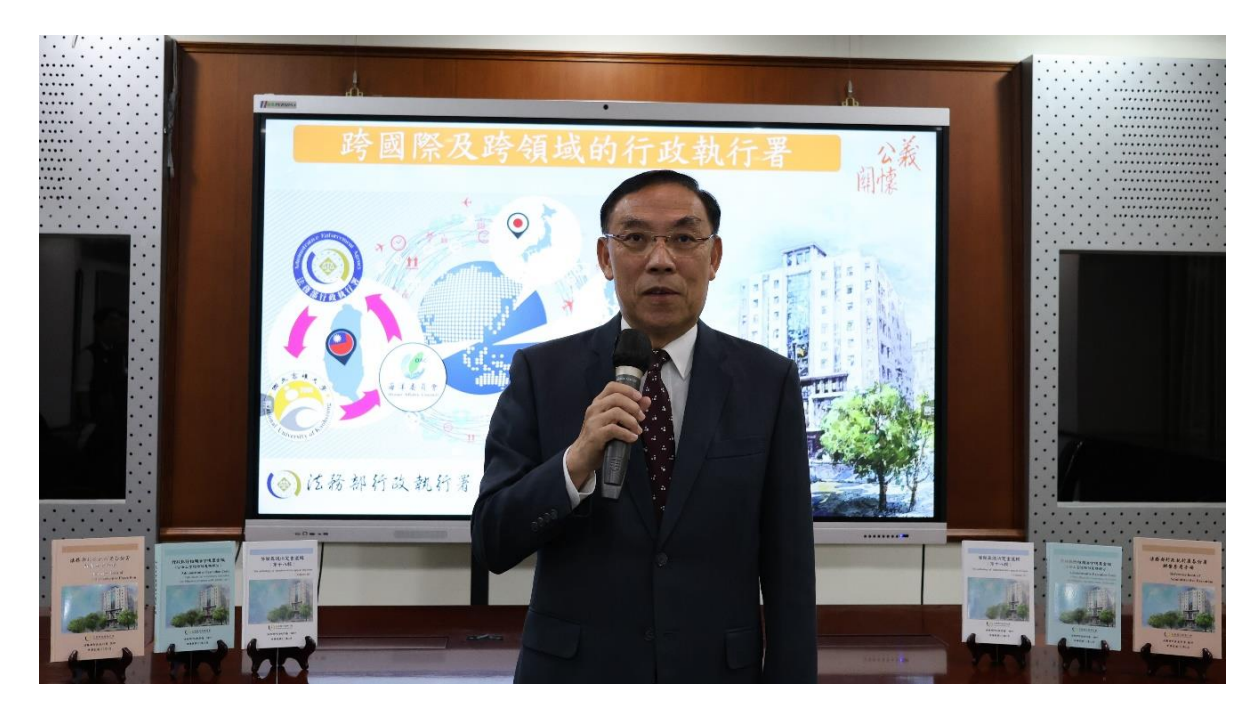
Minister Tsai giving the speech