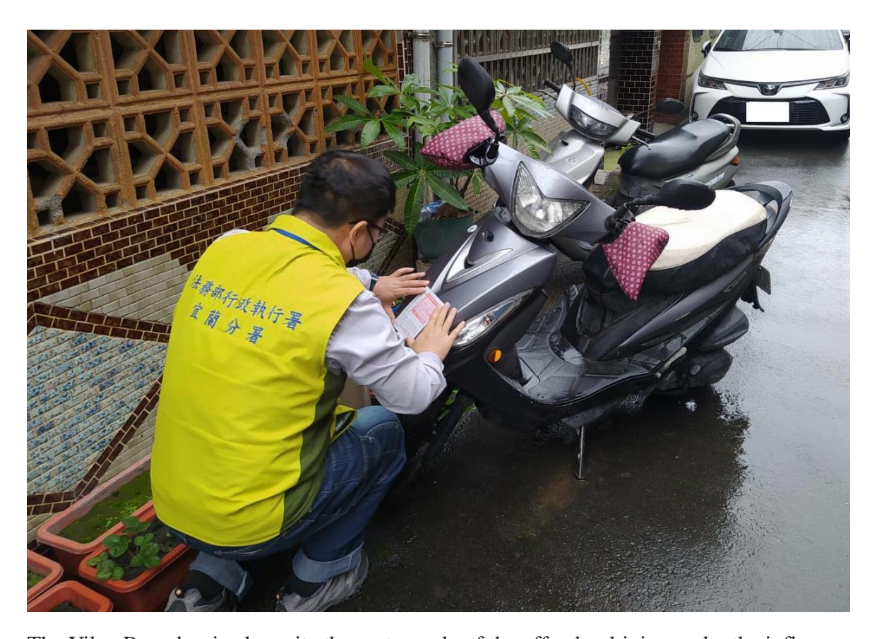
The Yilan Branch seized on-site the motorcycle of the offender driving under the influence.