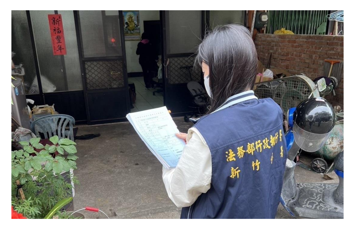
The Hsinchu Branch seized on-site the real estate of offenders driving under the influence. The Taichung Branch sent personnel to deliver the registration documents of real estate of