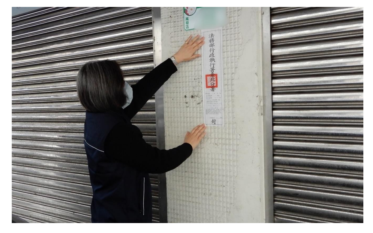
The Taipei Branch seized on-site the real estate of offender driving under the influence.