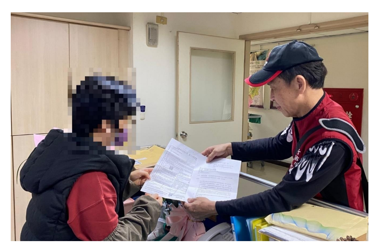
the offender driving under the influence to the land administration agency.