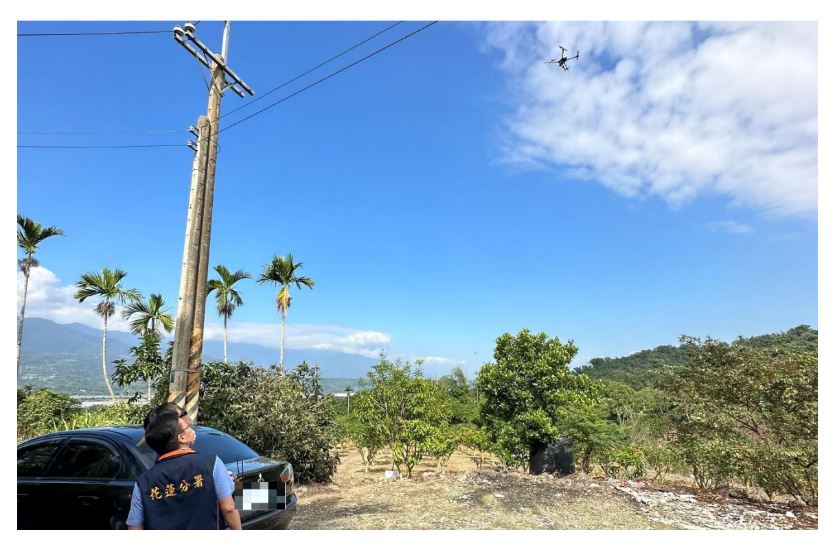
Page 11 of 12