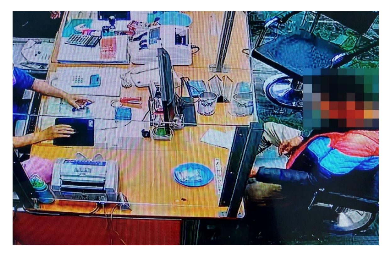
The Tainan Branch executed the deposits of offender driving under the influence, making the offenders visit the Branch to apply for payment in installments.

The Kaohsiung Branch seized on-site the vehicle of offenders driving under the influence.