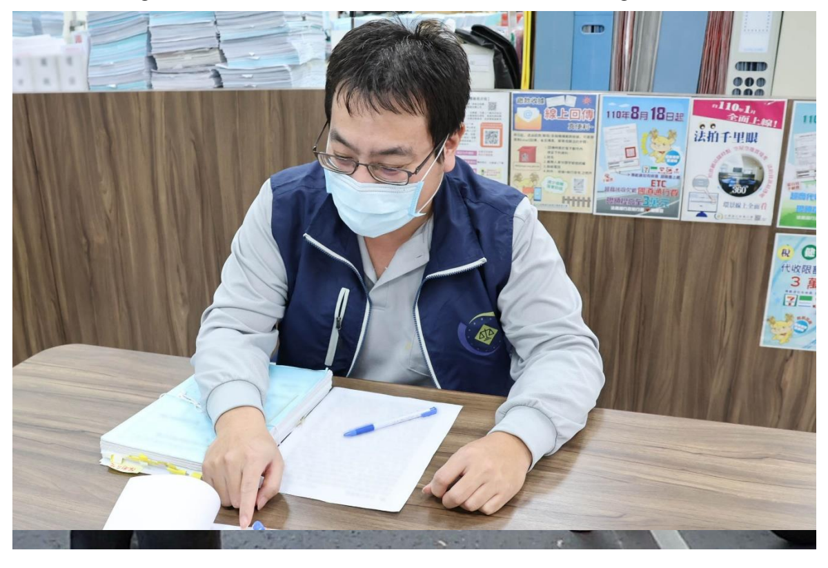
The Pingtung Branch executed the rental rights of the offender driving under the influence, and accepted the offender's application for payment in installments.

The Kaohsiung Branch seized on-site the vehicle of offenders driving under the influence.