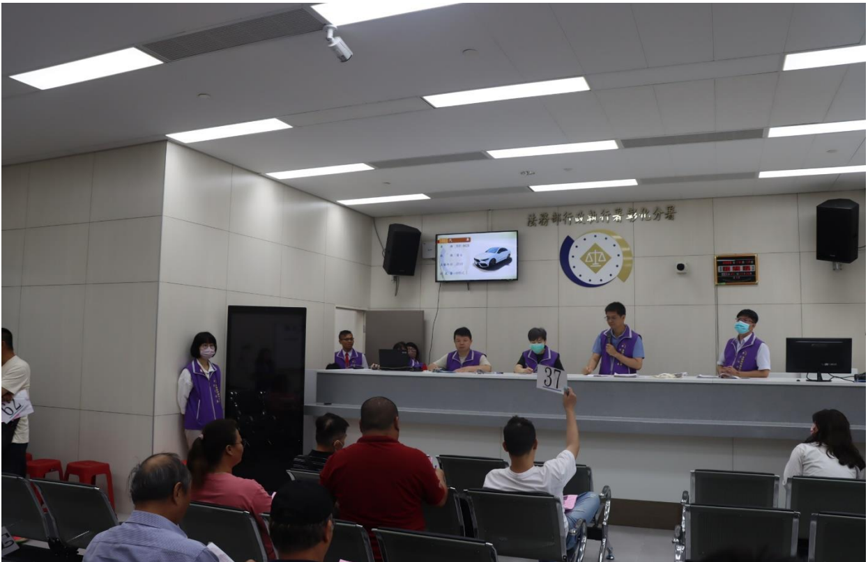
Upon request from the Changhua District Prosecutors Office, the Changhua Branch Office auctioned a white Mercedes-Benz manufactured in 2019 owned by