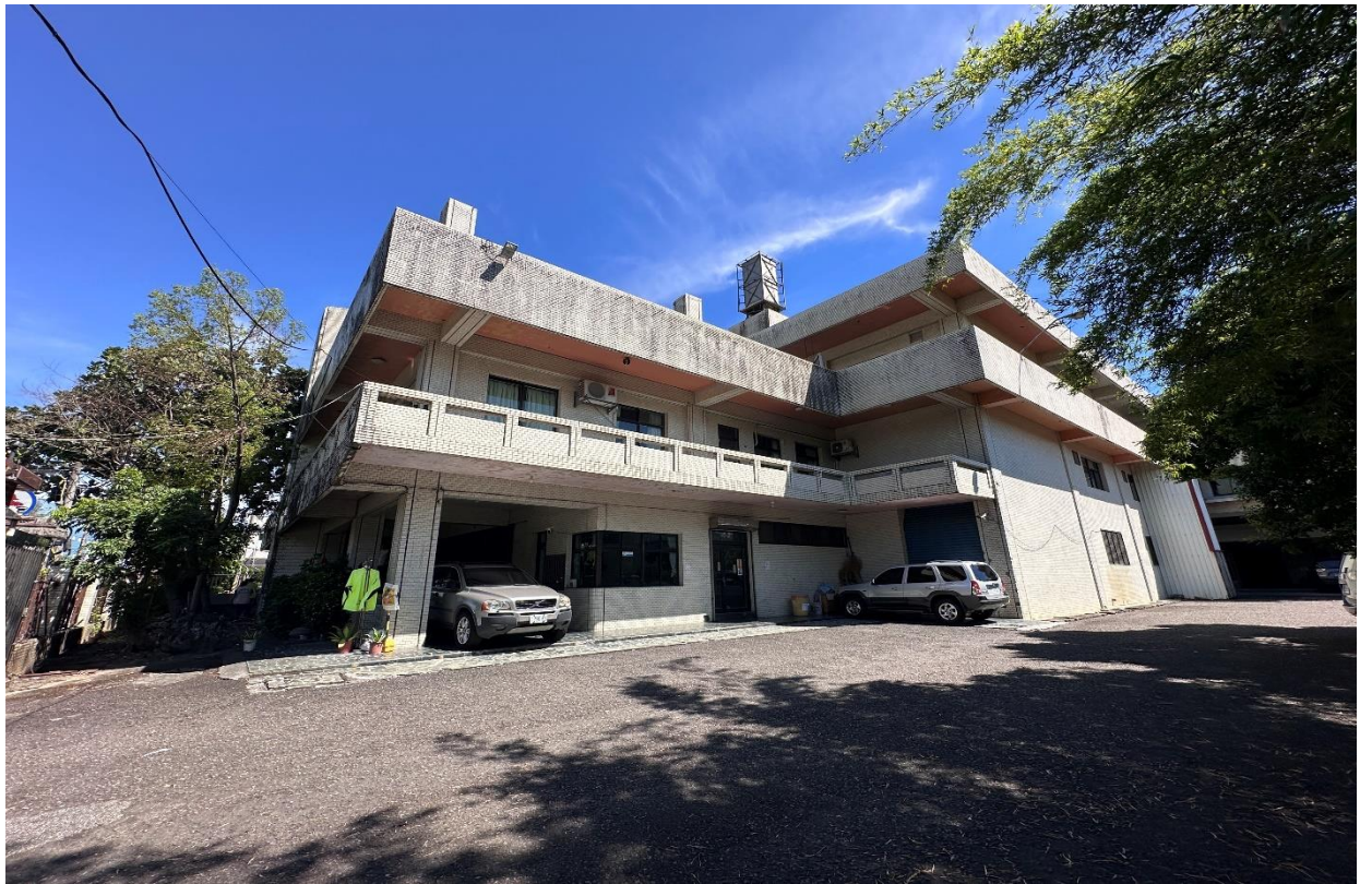
The Yilan Branch sold for NT$85.1 million a factory property in Wujie Township owned by obligor Jin ○ Garment Industrial Co., Ltd.