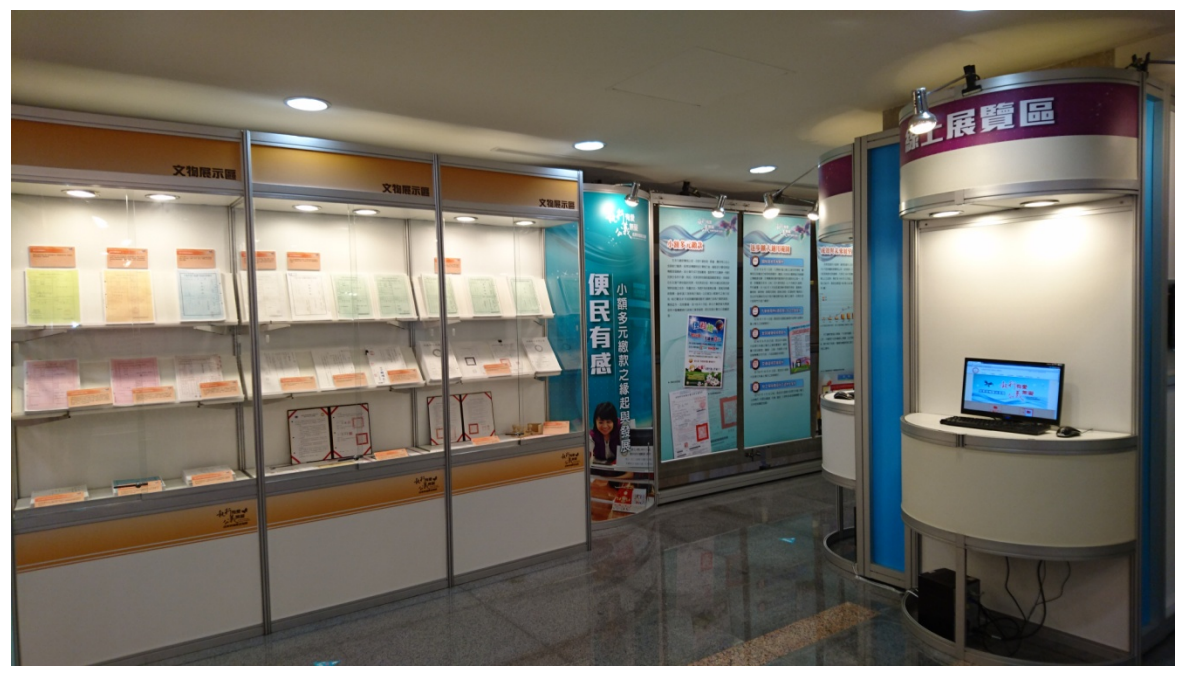
scene of the exhibition