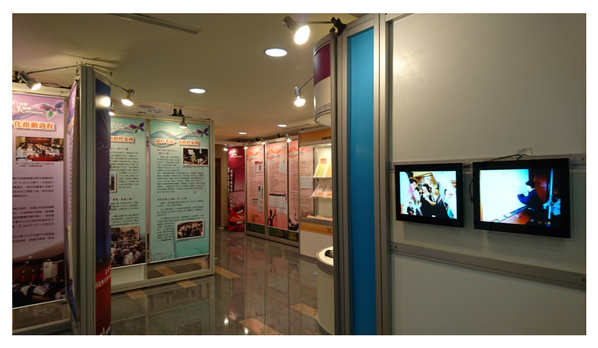
scene of the exhibition