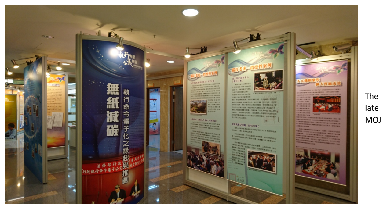
scene of the exhibition